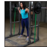
Band Pegs PPRBP