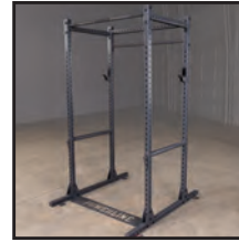
Power Rack PPR1000