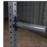
Weight Horn PPRWH