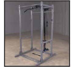
Lat Attachment PLA1000