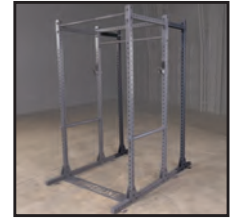
Power Rack Extension PPR1000EXT